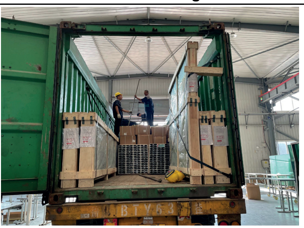
Seal seml-Container door